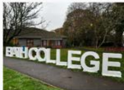
English & Maths