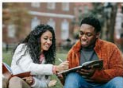
English Language School